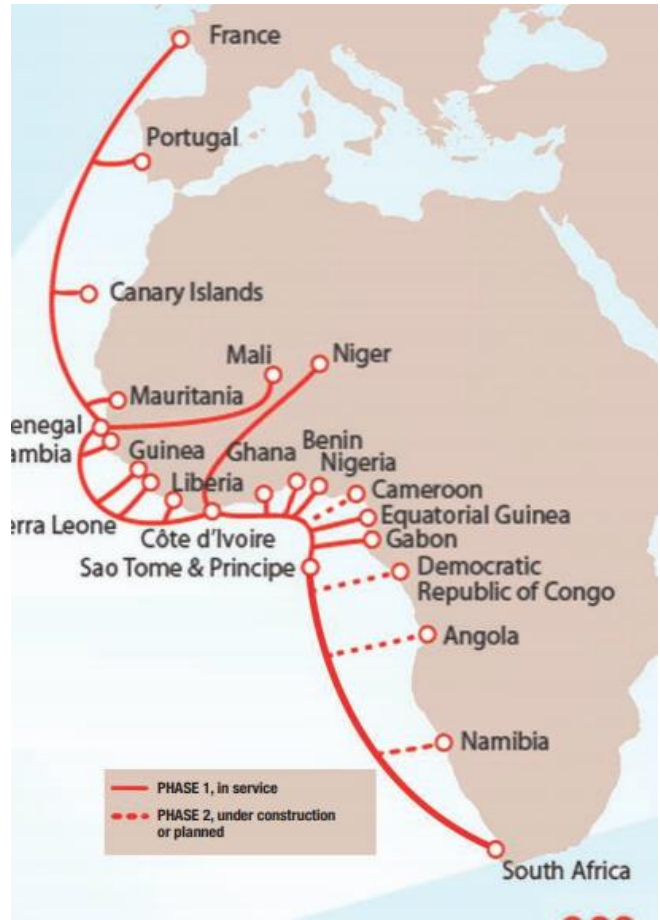
Figure 2: ACE: 17,000km long broadband optical submarine cable between Africa and Europe

Nigeria has six active international submarine fiber optic cable networks that formed the core networks (Agboje, Adedoyin, & Ndujiuba, 2017). Five of them are connected to the world through Europe while the sixth is connected to Cameroon. Lagos, Nigeria is the landing points of all these fiber optic cables. The submarine cable to Cameroon is called Nigeria Cameroon Submarine Cable (NCSCS) with a cable length of 1,100km owned by Cameroon Telecom (CAMTEL) and its landing points are Kribi, Cameroon and Lagos, Nigeria (Agboje et al., 2017).